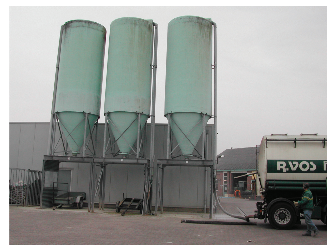
Closed Bin, Hopper or Silo – Fertilizer contained within the bin is filled pneumatically or by other suitable means and is recovered from the bottom.

GUIDANCE FOR THE STORAGE, HANDLING AND TRANSPORTATION OF SOLID MINERAL FERTILIZERS